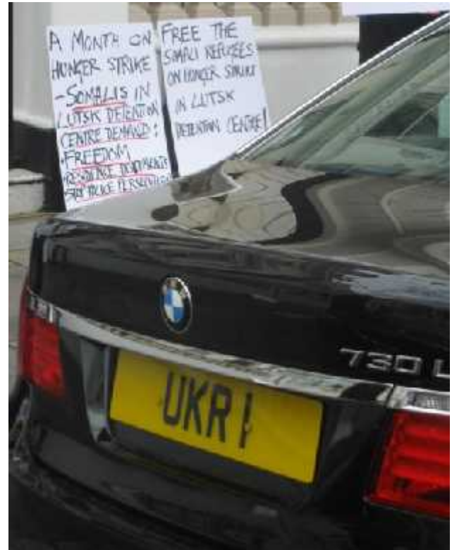
Outside the Ukrainian embassy

http://media.bordermonitoring-ukraine.eu/