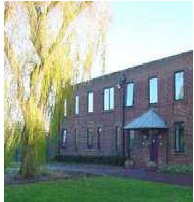
Photo of Campsfield on UK BA website. Will Campsfield now be rebranded 'The Weeping Willow', in the style of 'The Cedars', and sundry 'Houses' (Brook, Tinsley, Campsfield itself) dotted around the UK?

Email list: To join, send an email to closecampsfield-subscribe@yahoogroups.com