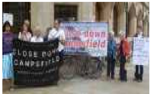
Demo in support of Sudanese hunger strikes, Carfax, Oxford

Most of the Sudanese refugees were soon released, although they were first divided and sent to different detention centres. Sadly, one of them is still in detention. This hunger strike did not happen in isolation. People without papers across the world continue to refuse food in protest at their detention and repression. Systematic suppression of people without papers is part of daily life in Europe.