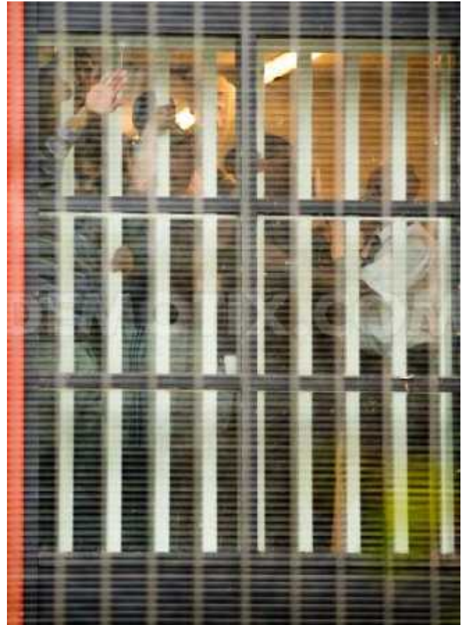
Detainees at the window, Harmondsworth

campaign groups held a noise demonstration outside the centre to show the staff, detainees and visitors that they would 'not let this death be silenced!' With megaphones, horns and whistles activists made their presence known to the people inside.